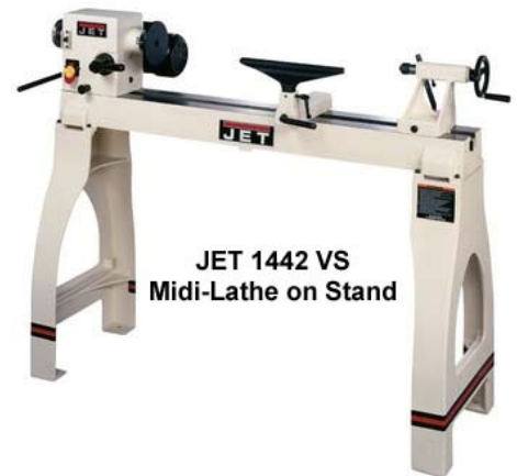
JET 1442 VS Midi-Lathe on Stand

Lot 3A and 3B (above): Two $100 Gift Certificates. From Eagle America