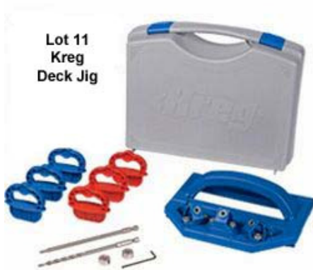
Lot 11 Kreg Deck Jig

Lots 10 a, b, c & d: Four one-day seats valued at $135 each at an upcoming Woodworking Class at The Woodwright's School in Pittsboro – 4 winners will each select which workshop they wish to attend.