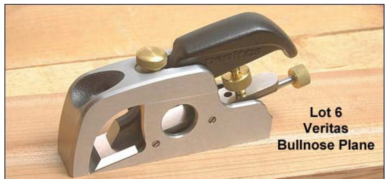
Lot 6 Veritas Bullnose Plane

Lot 6 (above): Lee Valley Veritas Bullnose Plane with A2 blade – Retail Value $169. From Lee Valley Tools.