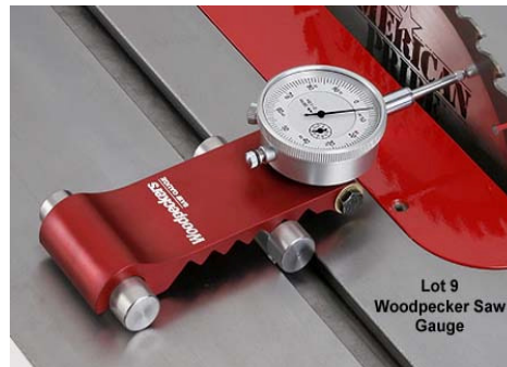
Lot 9 Woodpecker Saw Gauge