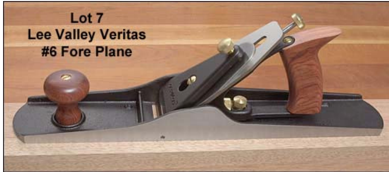
Lot 7 (above): Lee Valley Veritas© #6 Fore Plane – Retail Value $265