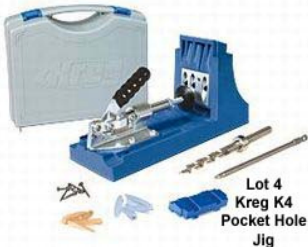
Lot 4 Kreg K4 Pocket Hole Jig

Lot 5 (above): $500 tuition credit for Woodworking instruction at our studio (group, private, or one on one). Retail Value $500.