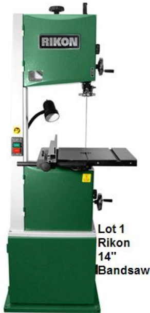
Lot 1 Rikon 14" Bandsaw

$5 per Ticket – Supports Non-Profit Activities