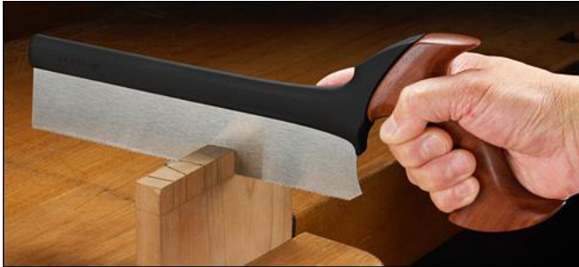
Lot 7 - with Marking Gauge