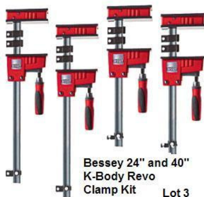
Bessey 24" and 40" K-Body Revo Clamp Kit