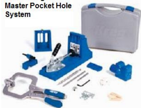
Lot 4 - Kreg K4 Master Pocket Hole System

Lot 4 (left): Kreg K4 Master Pocket Hole Jig System. Retail Value $149.99. From Kreg Tool Company.