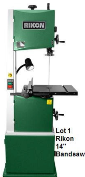
Lot 1 Rikon 14" Bandsaw

Lot 2 (below): Precision Router Lift V2 (Winner selects mounts for their router) – Retail Value $329.95. From Woodpeckers, Inc.