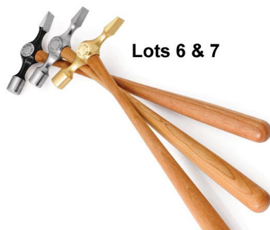
Lots 6 & 7

Lots 3, 4 and 5: Lee Valley Tools, Veritas© DX-60 Precision Block Plane, Veritas© Medium Shoulder Plane and Veritas© Small Router Plane. Total Retail Value $435